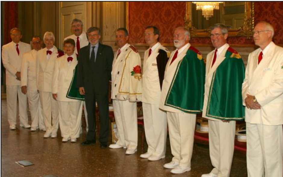
Royal Rosarians meet with the Mayor of Bologna

Leavenworth Autumn Leaf Festival September 23, 24, 25 & 26, 2005