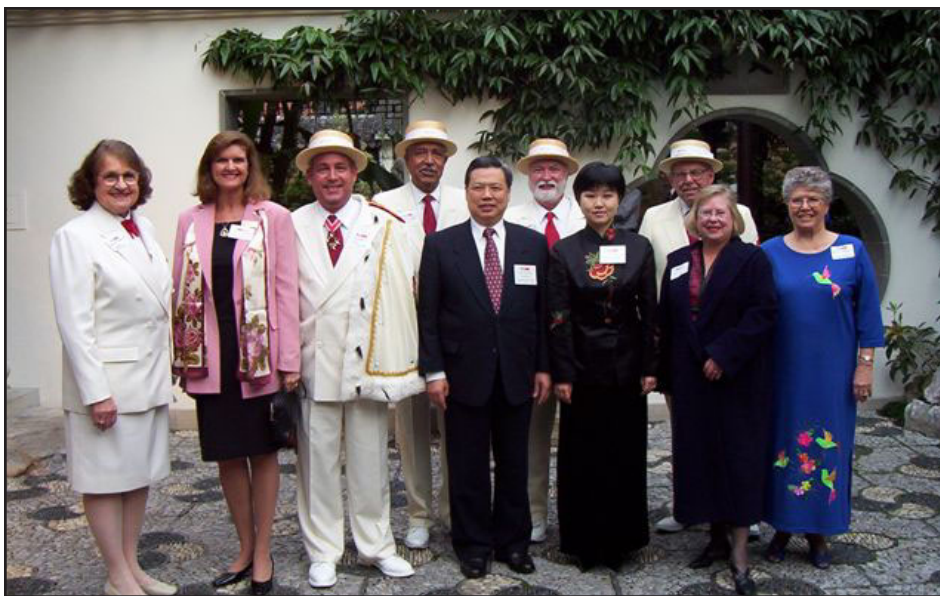
Rosarians gather at the Classical Chinese Garden to celebrate its 10th anniversary.